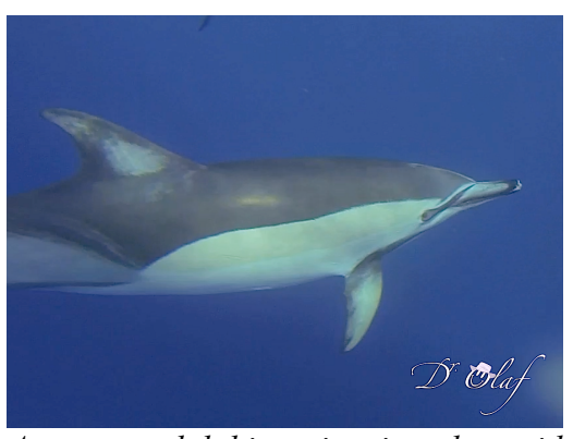
A common dolphin swimming along side the sailing boat near the Bay of Plenty in New Zealand.

Two HHR supported research expeditions were undertaken this year. A New Zealand expedition in January and February lead by Dr. Olaf and supported by a number of participants and the SY NONO management. The mission revealed declining numbers of dolphins in the Bay of Plentv. Numerous plankton samples were taken and analysed while sailing almost 1000 km along North Island shores. A second expedition was undertaken in August along the Great Barrier Reef to determine hot spots of humpback whale calving areas with hot spots determined south of Abbott Point and the southern Whitsundays.