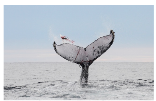
A humpback whale entangled in rope trying to free itself. 3<sup>rd</sup> August offshore GC

to free itself from a rope that started to cut through its fluke. We therefore urge you to support us in obtaining a research and rescue vessel that would allow us to help these animals.