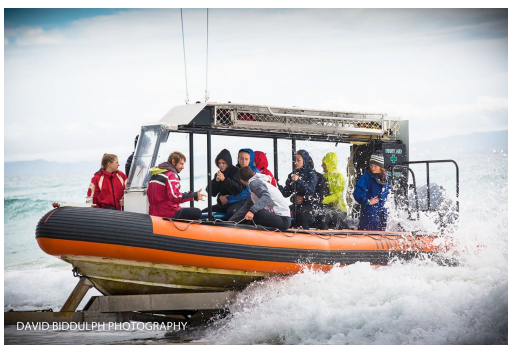
Humpback whale surveys at North Straddie supported by Rustic Pathways.

strategies to overcome income loss from increasing storm events and shifts in migration.