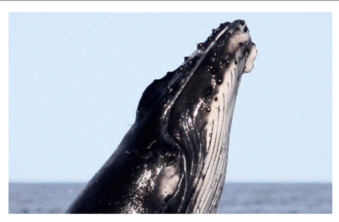
One of the many newborn calves sighted on the Gold Coast in 2016.