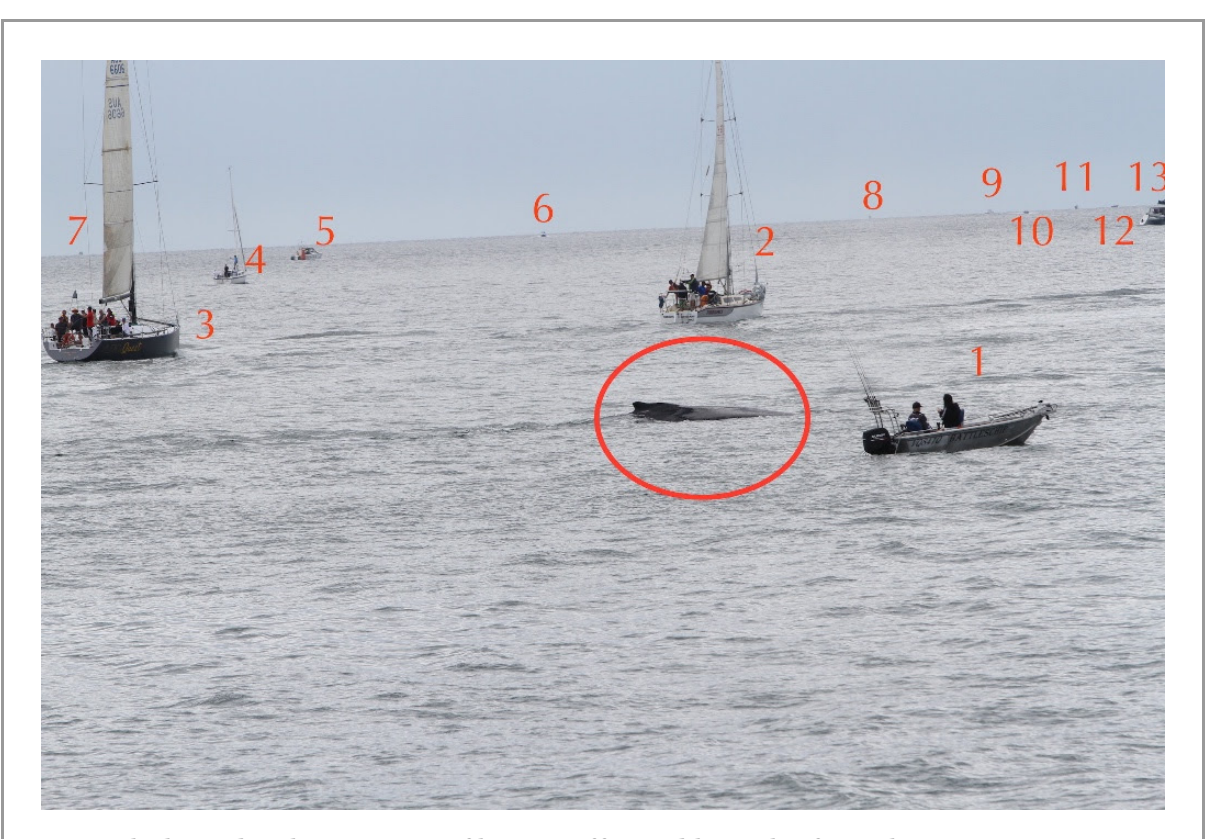
One whale and 13 boats! Lots of boat traffic and breach of regulations are becoming a regular occurrence in the Gold Coast bay.