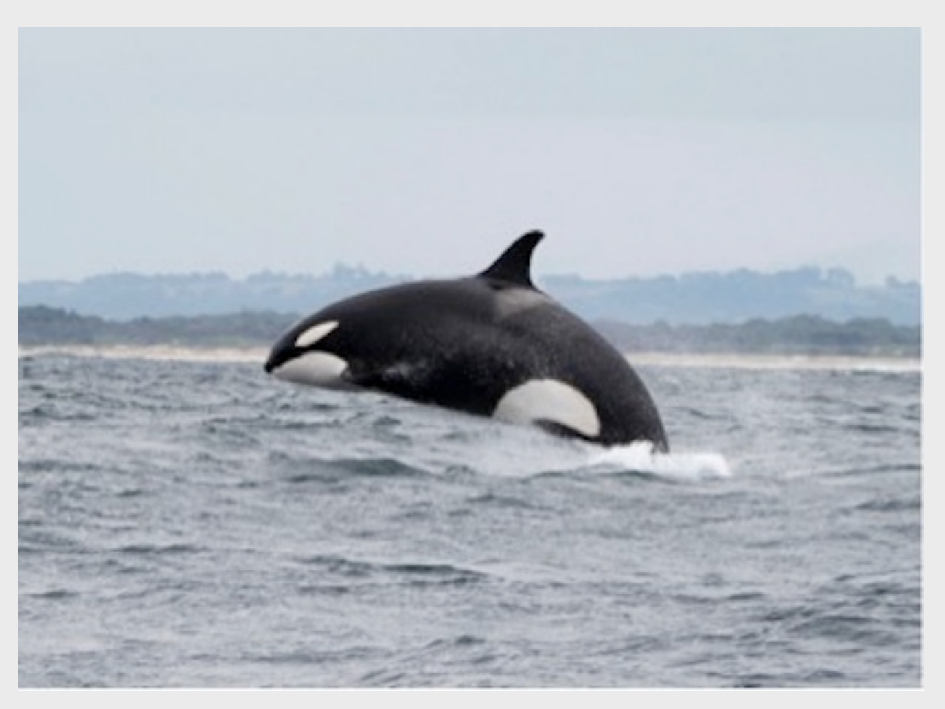
A pod of Orcas in Ballina chasing humpback whales. A rare sighting on the east