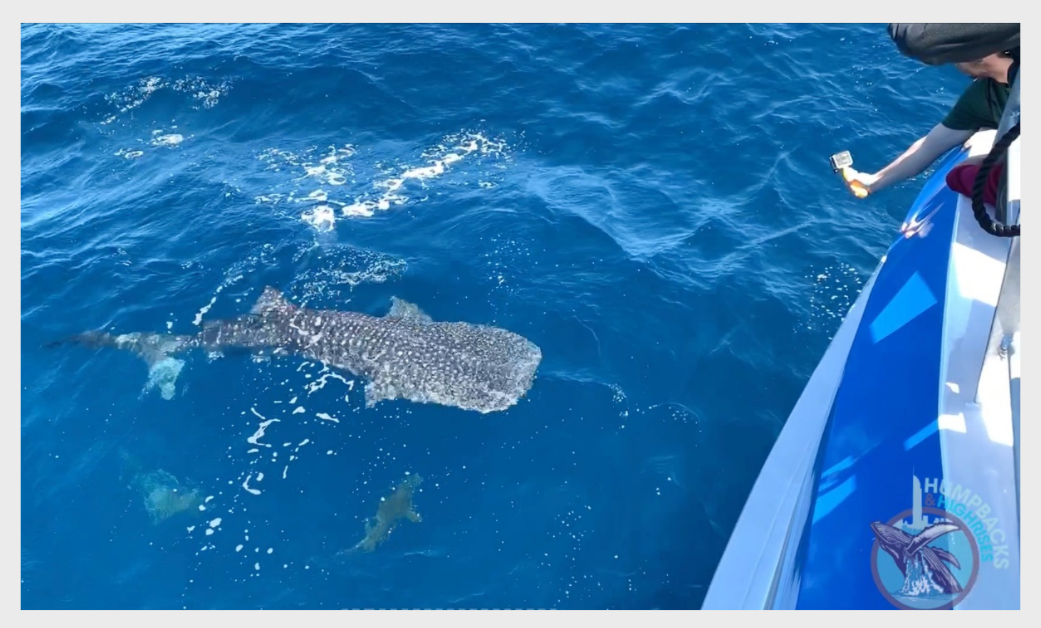
Once in a life time encounter. A juvenile whale shark checks out one of the whale watch boats during a HHR survey.

Whale, shark or whale shark by Taryn-lee Perrior