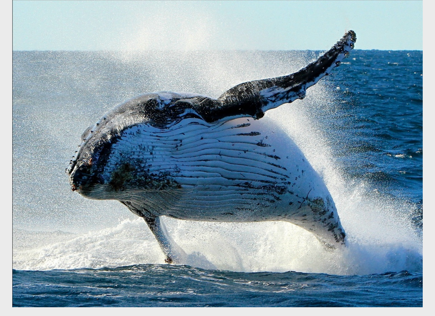
We love our humpback whales. The most acrobatic whale species of them all. Creating sound waves under water for communication. The big splash.